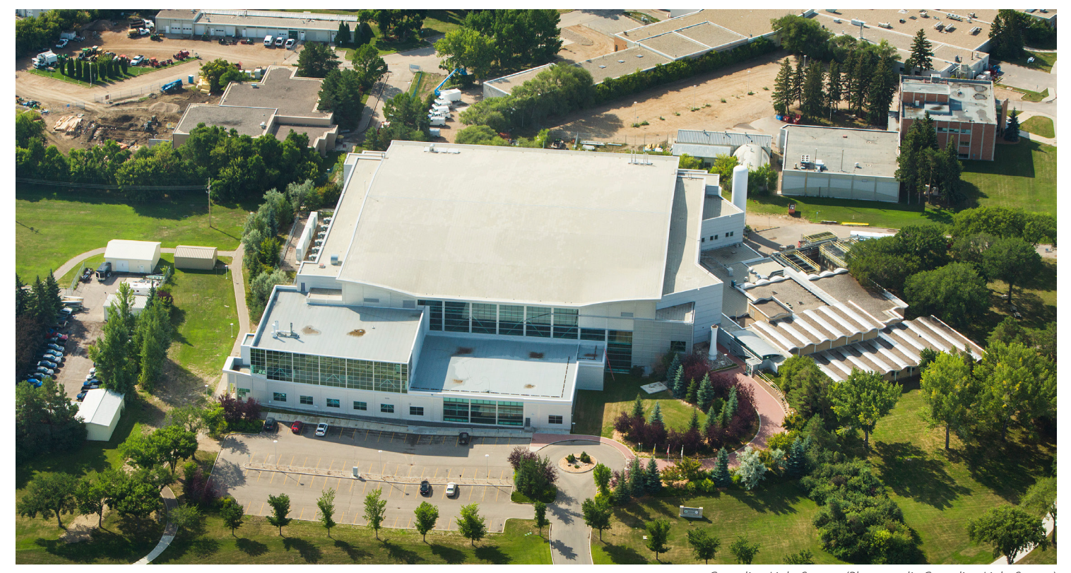
Canadian Light Source.

Canadian Light Source (CLS): The CLS is Canada's only synchrotron light source facility and one of the nation's largest scientific investments. Located at the University of Saskatchewan, the CLS provides Canadian and international scientists with the unique capacity to conduct research in the areas of physics, material science, biology and medicine.