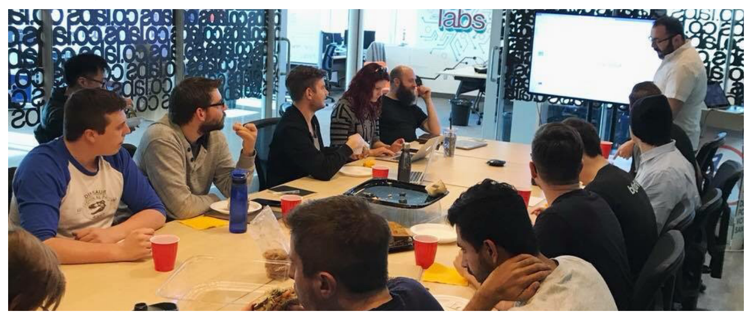
Co.Launch mentoring session at Co.Labs

Co.Labs : In less than a year since IS established Saskatchewan's first technology incubator, we already saw significant return on investment. Early-stage technology startups now have access to mentorship, programming and community co-working space, without having to leave the province. Companies in Co.Labs' program have secured over $2.85 million in private equity investment, with the potential for an additional $5 million. Through its partnership with Co.Labs, IS will continue supporting local technology entrepreneurs to start and grow their companies in Saskatchewan.