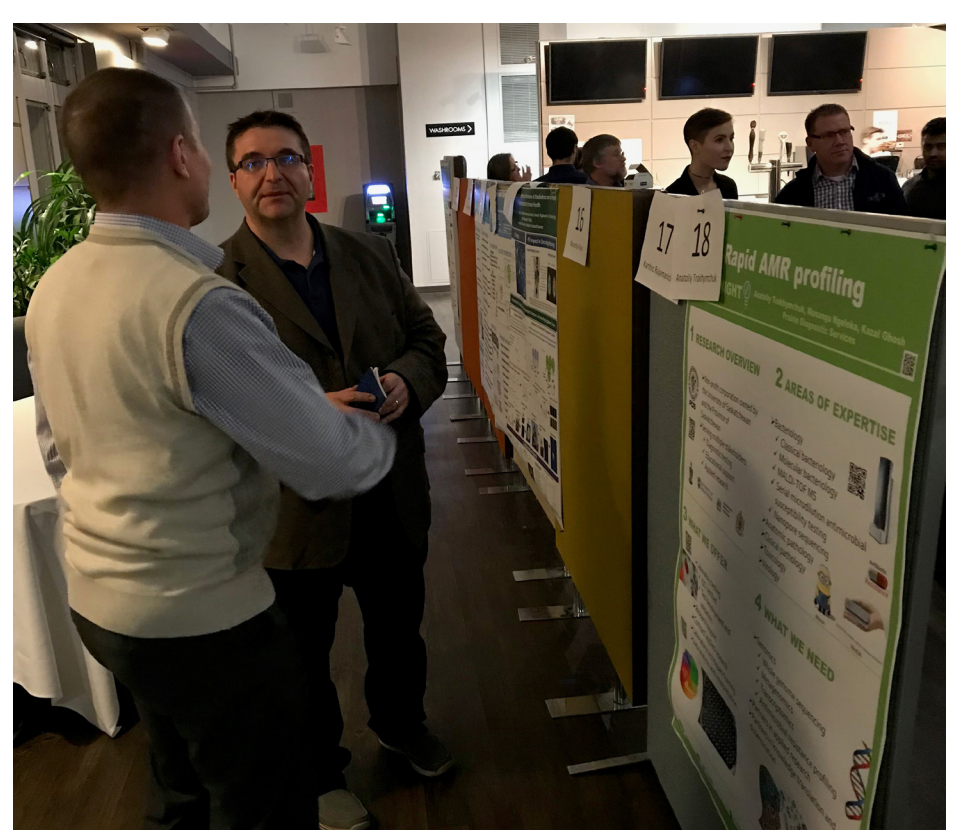
SPARK Night at Louis' Loft