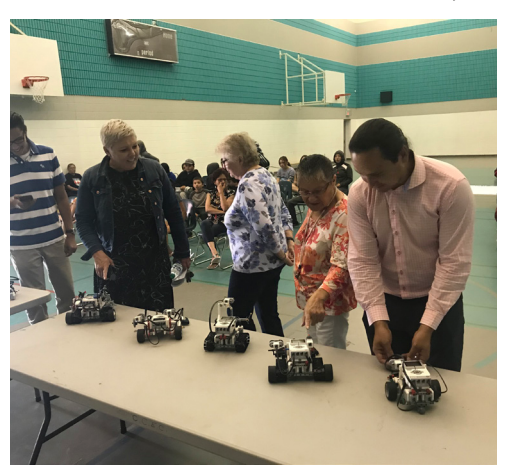
RoboYOU finale at the Cowessess Community Educational Centre