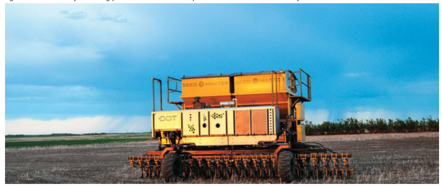
DOT Autonomous Power Platform

Digital and autonomous agriculture is quickly becoming a reality, with Saskatchewan at the forefront of the movement. In 2017-18, IS provided SAIF funding to DOT Technology Corporation to develop and pilot its autonomous tractor. Once fully developed, the tractor will be able to complete various tasks on farms autonomously (seeding, spraying and harvesting), with minimal human supervision. This innovative, made-in-Saskatchewan solution will improve the productivity of Saskatchewan's agricultural sector by reducing producers' costs and dependence on labour availability.