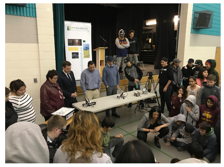
RoboYOU launch event at the Cowessess Community Educational Centre

Beginning in January 2018, IS piloted a robotics and coding program called RoboYOU at Cowessess and Kahkewistahaw First Nations schools to improve early engagement of youth in science, technology, engineering and math (STEM). This program provides students in grades five to nine the opportunity to build and code their own robots over a sixmonth period. RoboYOU was developed alongside local educators and has been well received.